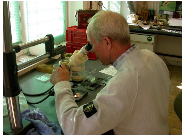
Looking at fossil plants, Botanical Garden, Frankfurt on the Main, 2003

plants and gardens is contagious when he talks about them. He has his favourite plants, such as tillandsias, fuchsias, orchids, willows and carnivorous plants, some of them growing in his private garden. He described Pinguicula esseriana B.Kirchn. and named it after the first